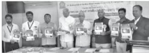
सिल्लोड : येथील इंद्रराज महाविद्यालयात बौद्धिक संपदा हक्क या विषयावर राष्ट्रीय चर्चासत्र झाले.

सिल्लोड, दि. ९ (सा.भा.) - बौद्धिक संपदा हक्काचे महत्त्व अनन्यसाधारण असून, ही संपदा कोणीही हिरावून घेऊ शकत नाही. कायद्यानुसार जर कोणी हे अधिग्रहित करित असेल तर या कायद्यामध्ये दंडाची तरतूद आहे. कायद्यानुसार जर कोणी हे अधिग्रहित करित असेल तर या कायद्यामध्ये दंडाची तरतूद आहे. कायद्यानुसार जर कोणी हे अधिग्रहित करित असेल तर या कायद्यामध्ये दंडाची तरतूद आहे.