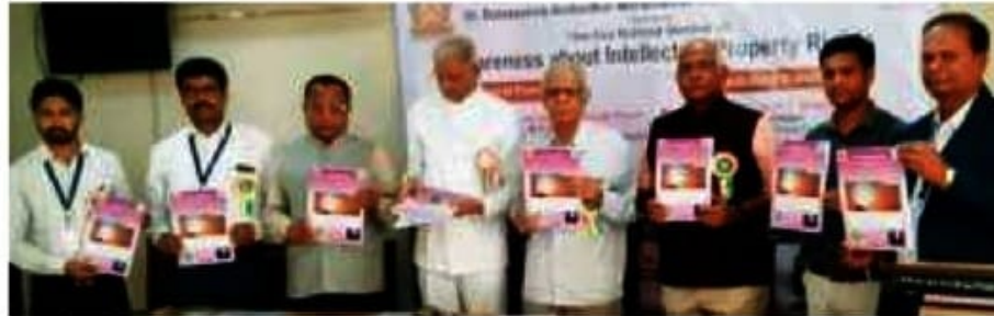
Dignitaries seen during the release of a research souvenir in the inaugural session of the national seminar on 'Intellectual Property Rights,' held at Sillod on Tuesday.