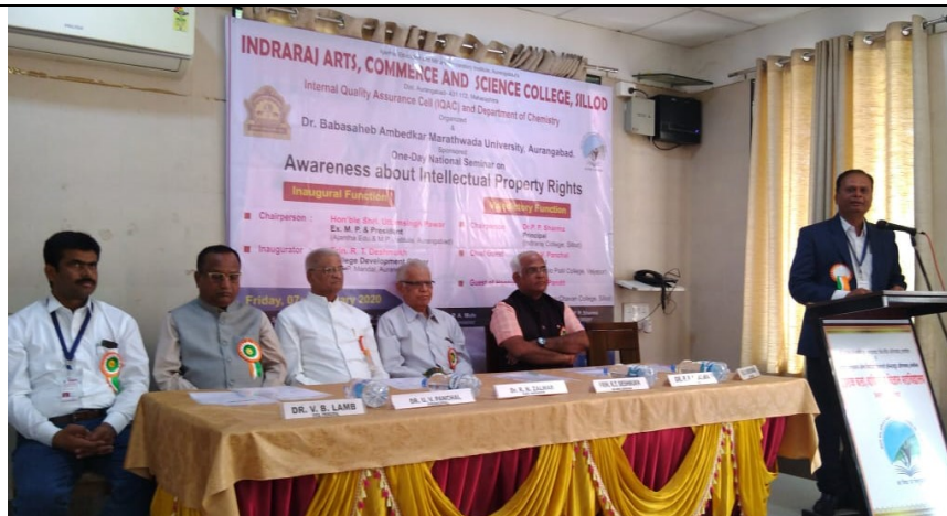
Convener of Seminar introducing about the theme of seminar