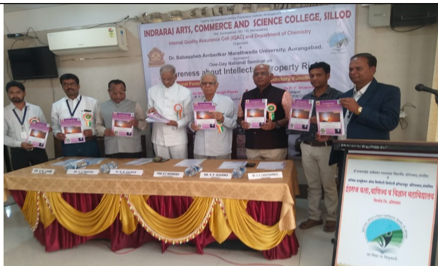
Publication of Seminar souvenir